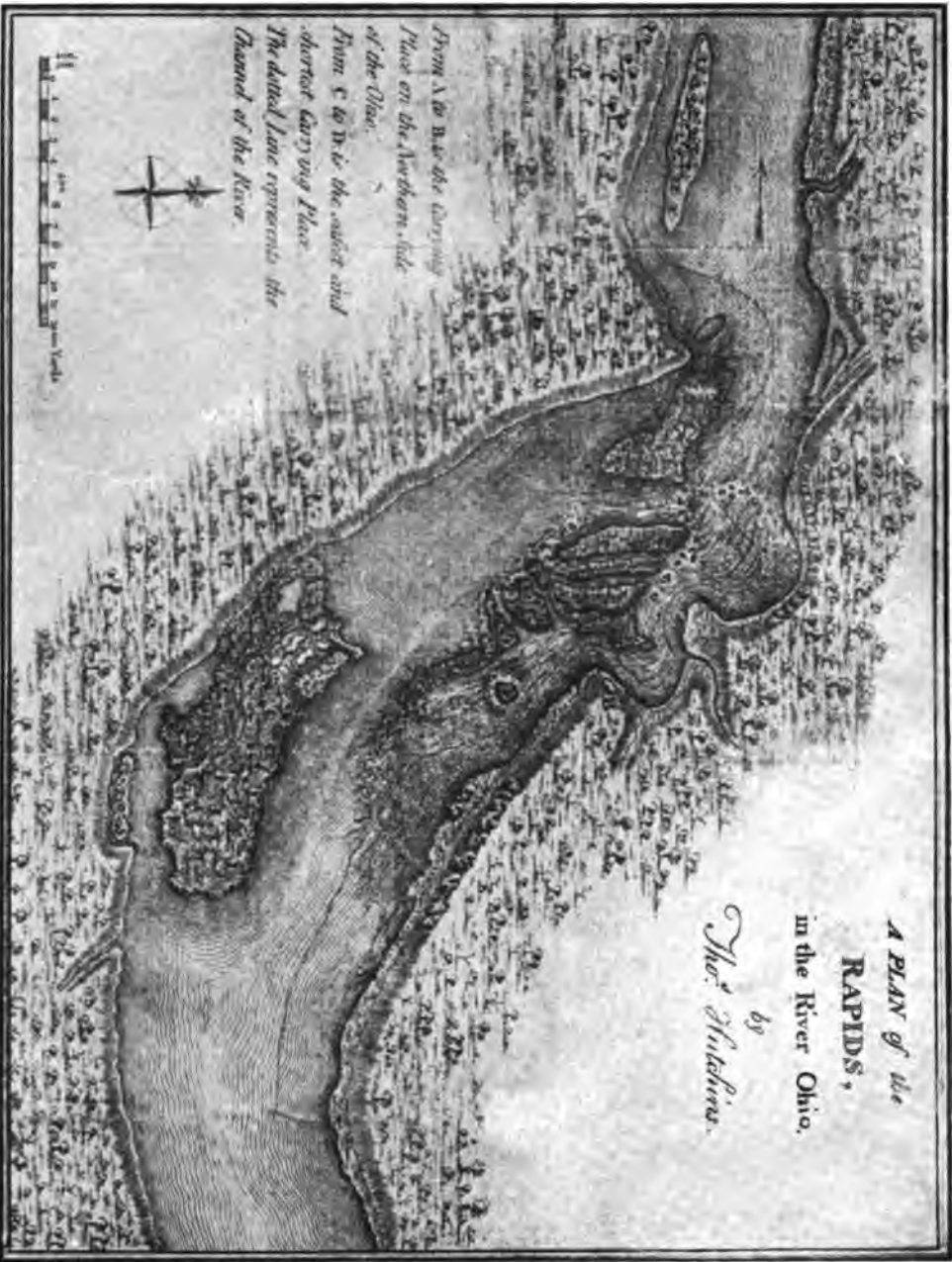
HUTCHINS' FALLS OF THE OHIO IN 1766